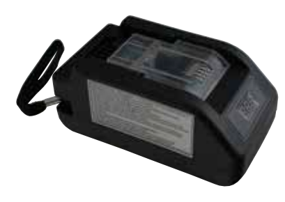
CH-07 18V Li-Ion Battery Charger