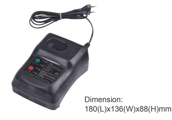
CH-06 14.4V Ni-MH Battery Charger