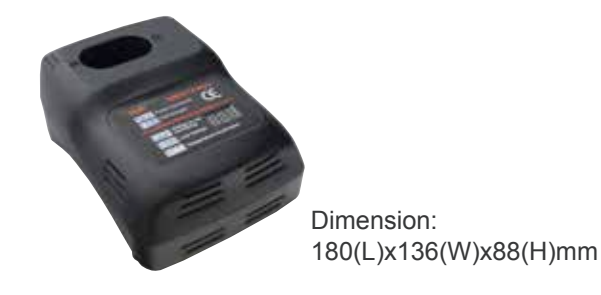
CH-09 14.4V Li-Ion Battery Charger