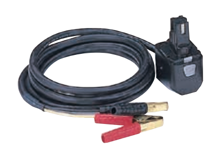
BD-110 (AC110V) POWER CHANGE BD-220 (AC220V) POWER CHANGE